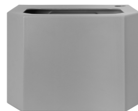
PE Water container - grey