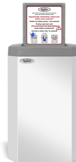
5 White RAL 9003