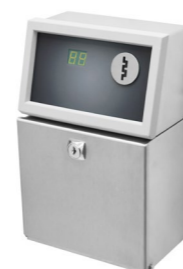
Token timer CM 100