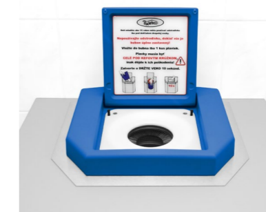
Blue top plastic