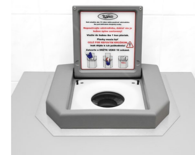
Grey top plastic