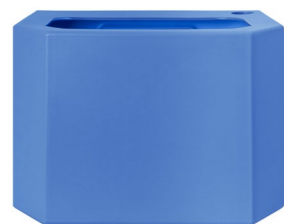
PE Water container - blue