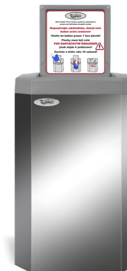
7 Stainless steel