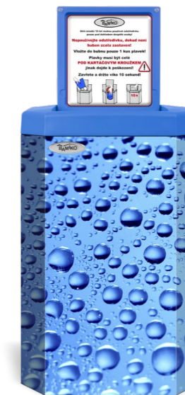
3 Water droplets