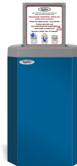
1 Blue RAL 5017