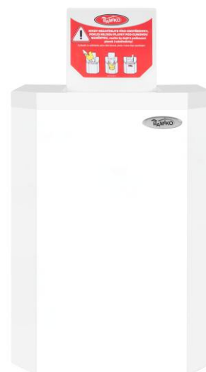
6 White RAL 9003