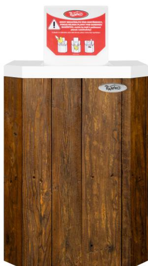
4 Dark wood