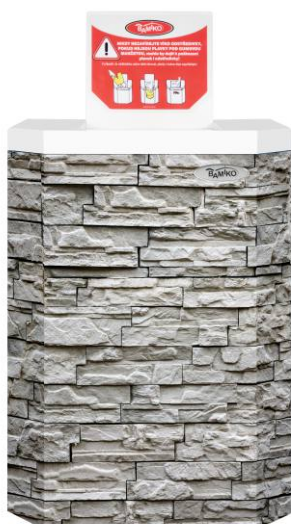
7 Stone wall