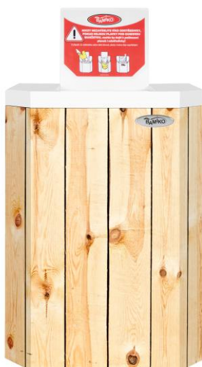
5 Light wood