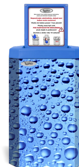
3 Water droplets