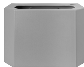
PE Water container - grey