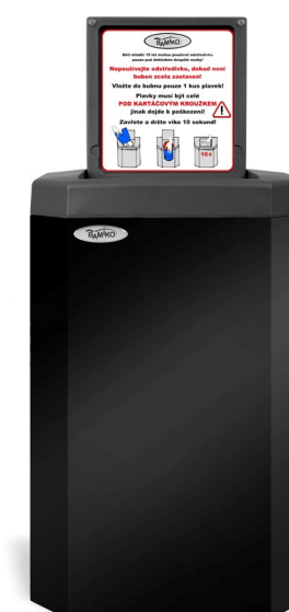
10 Matte black 9005