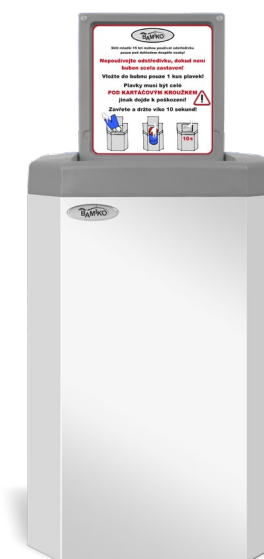
5 White RAL 9003