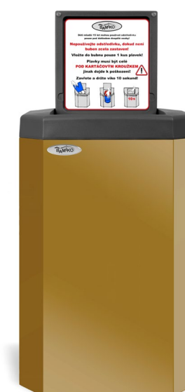
9 Metallic gold