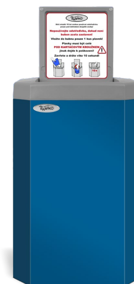
1 Blue RAL 5017