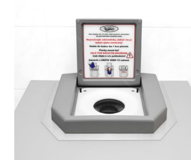
Counter top edition blue / grey / black plastic stainless steel frame