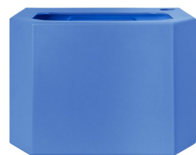
PE Water container - blue