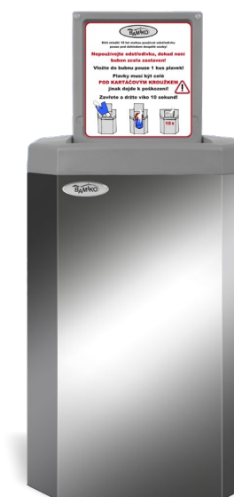
7 Stainless steel