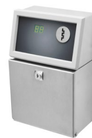
Token timer CM 100