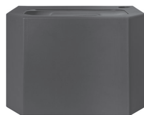
PE Water container - black