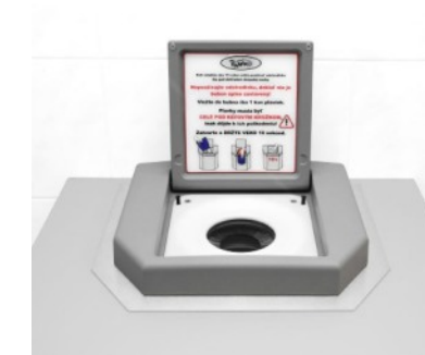
Counter top edition blue / grey / black plastic stainless steel frame