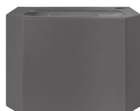
PE Water container - black