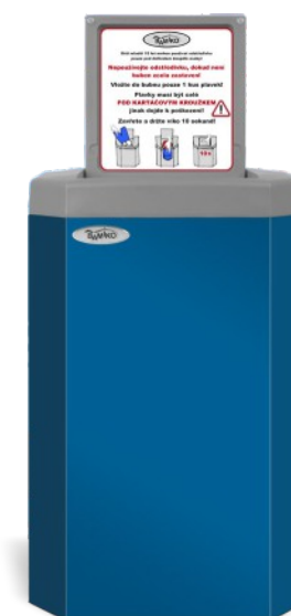
1 Blue RAL 5017