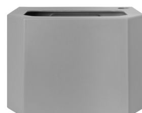
PE Water container - grey