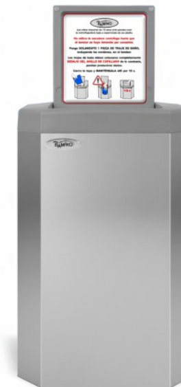
7 Stainless steel