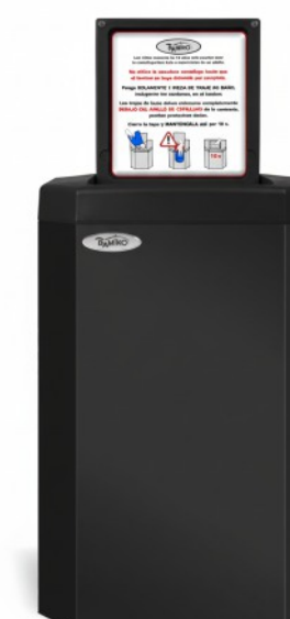
10 Black RAL 9005