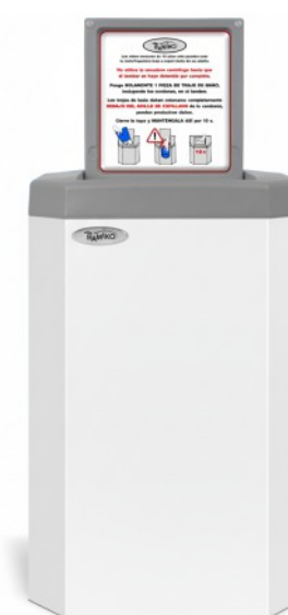
5 White RAL 9003