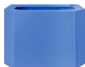
PE Water container - blue