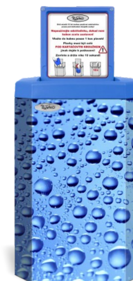
3 Water droplets