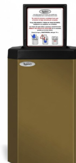
9 Deep bronze